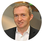
Ryan Law Geothermal Engineering Ltd.